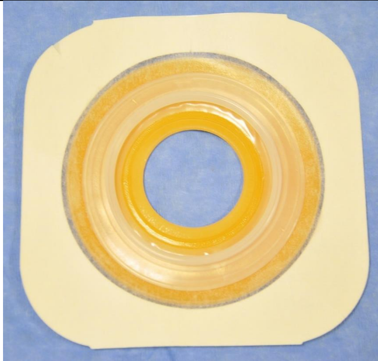
Tandem Skin Barrier – Floating Flag with Tape (Hollister)