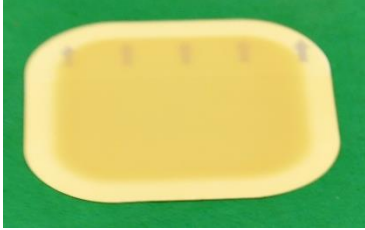
NU-Derm Hydrocolloid Wound Dressing