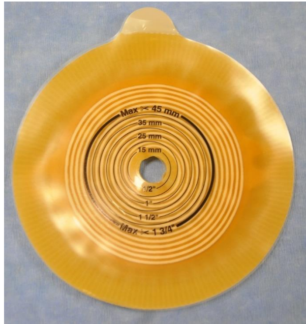
Base Plate with belt ear (Coloplast)