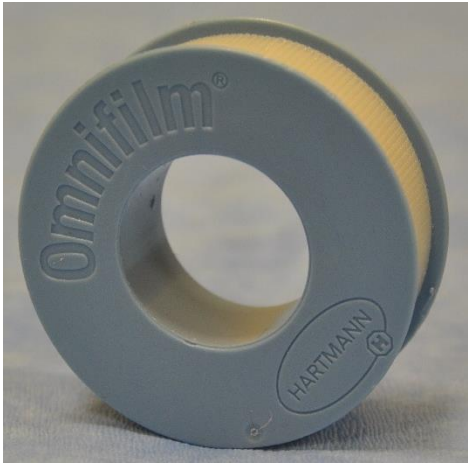
Plastic Adhesive Tape (Omnifilm)