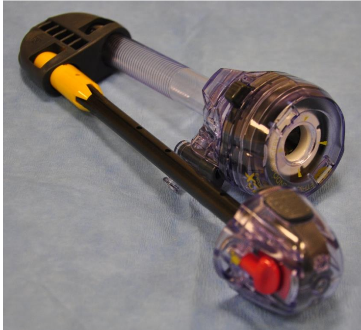
(5) Dilating Tip Trocar with Stability Sleeve (Endopath Xcel)