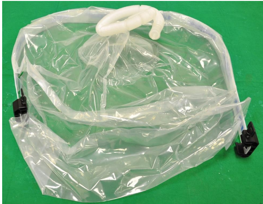
(1) Allen Catcher System