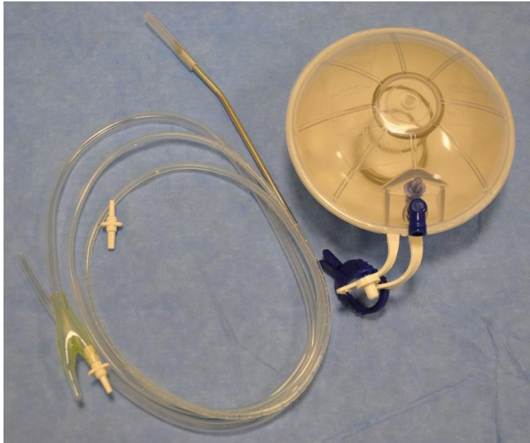
(4) Closed Wound Drainage System (Biovac)