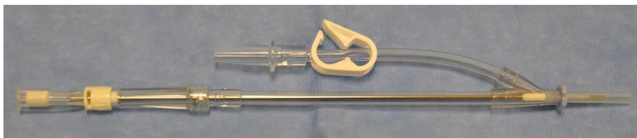
(12) Aortic Root Canula with Flow Guard (Meditronic)