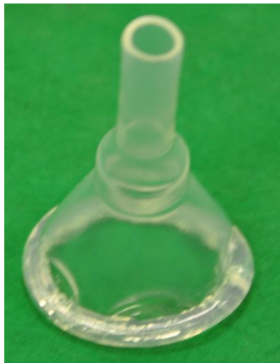
(7) InView Standard (Hollister)