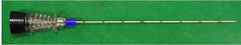
(6) Spinal Biopsy Needle (Kimal)