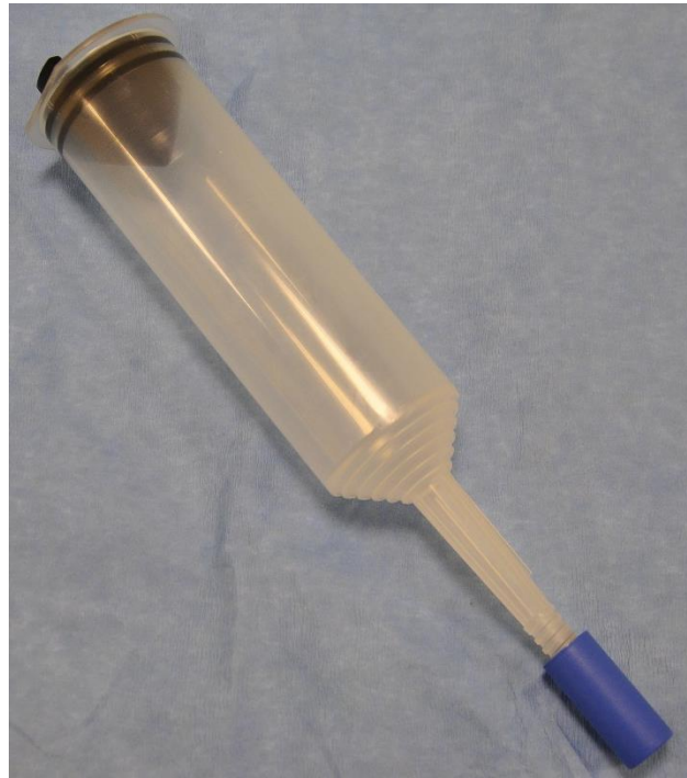
(9) Angiographic Injector Syringe with Fill Tube