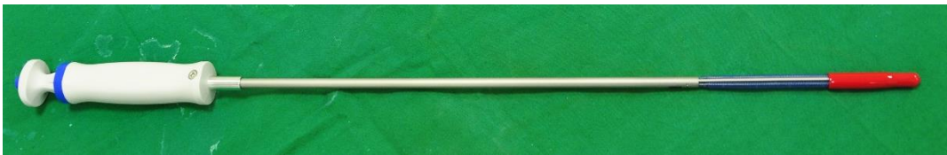
(2) Endoscopic Retractor (REVEEL)