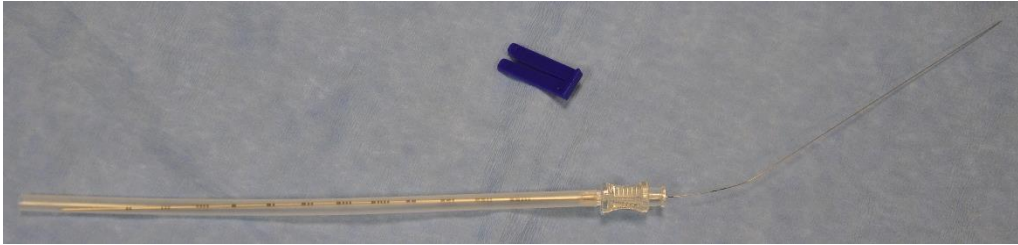
(10) Accura BLN (Angiotech)