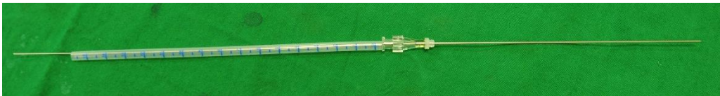
(3) X-Reidy Breast Lesion Localization Needle (COOK)