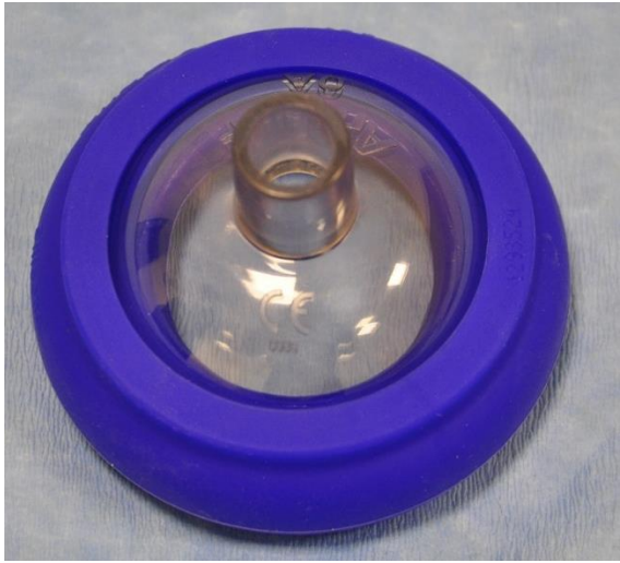
(13) Silicon Face Mask (Ambu)