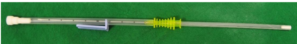
(4) GHIATAS Beaded Breast Localization Wire (Bard)