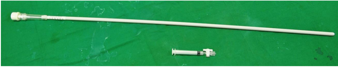
(5) Single Lumen Arterial Embolectomy Catheter (Prodimed)