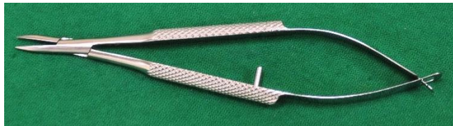
(11) Needle Holder (single use) (Visitec)