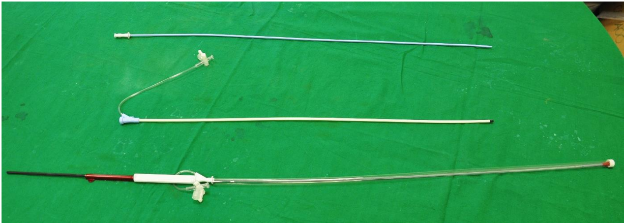
(14) Recovery Filter System Jugular/Subclavian (Bard PeripheralVascular)